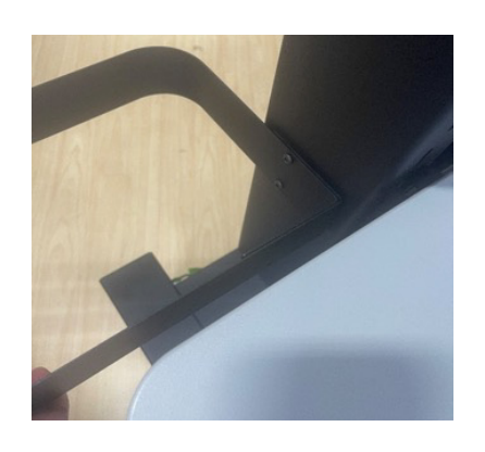
Place screws in holes on side or rear of vertical mast as shown. (This example is attaching the holder to the side of mast.)