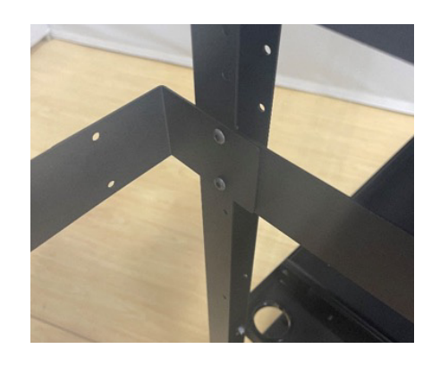
1. Place screws in holes on side of EC/QC frame as shown.