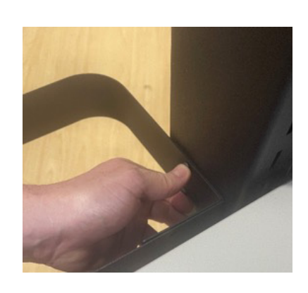
2. Place your thumb on the top screw to hold in place (as shown).