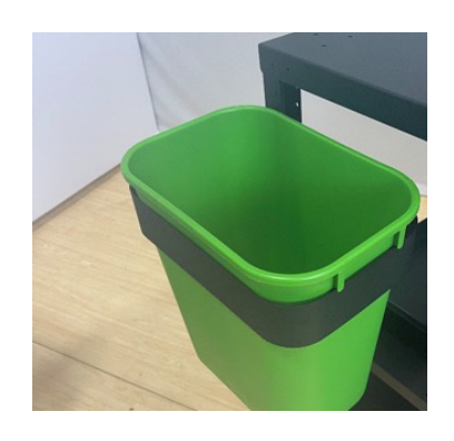
4. Place trash barrel in holder.