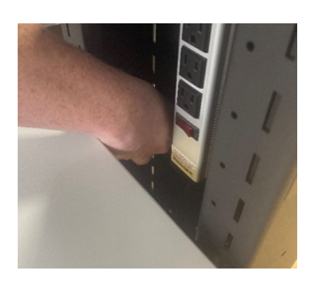
3. Use nut to secure screw from inside mast with other hand (as shown).