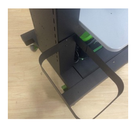
4. Repeat for second screw.