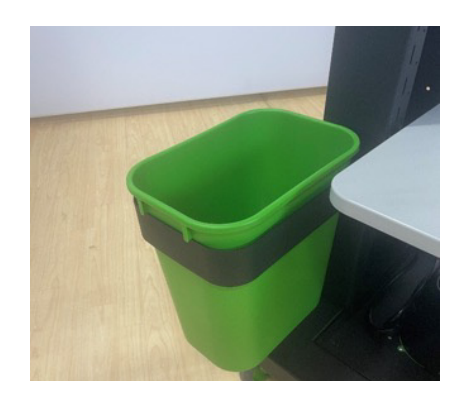
6. Place trash barrel in holder.