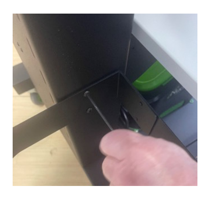
5. Tighten screws with Allen wrench as shown below.