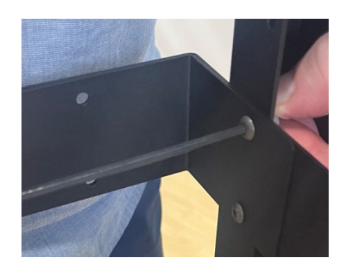
3. Tighten screws with Allen wrench as shown above.